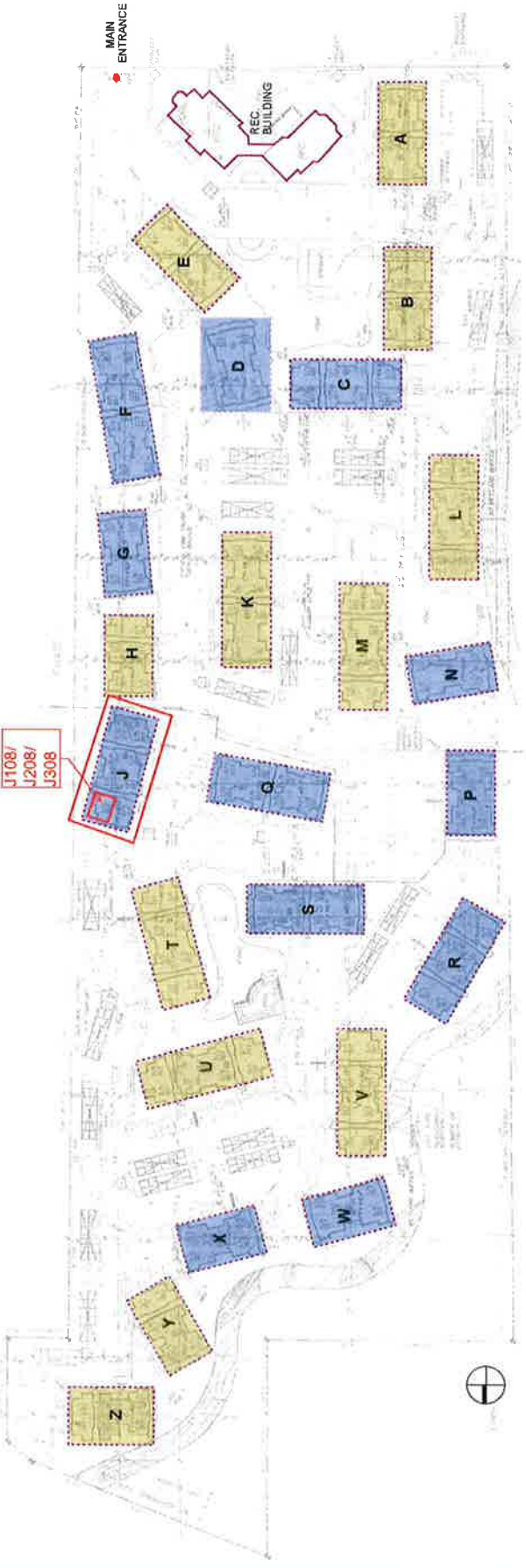
1 SITE PLAN - BUILDING SCHEME PLAN