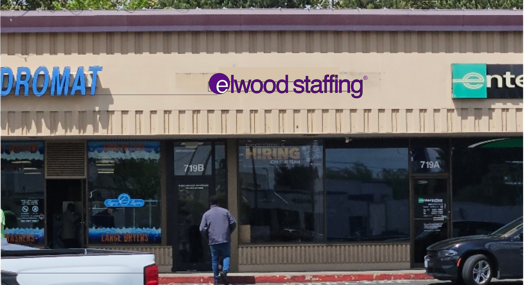
SCALE: 1/4"=1' SOUTH ELEVATION FASCIA SF= 338 SIGN SF=24