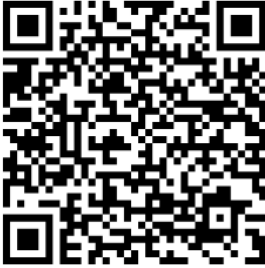
scan for current status