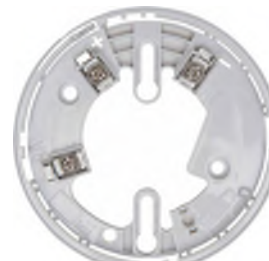
B501-WHITE Flangeless 4" Base (White)