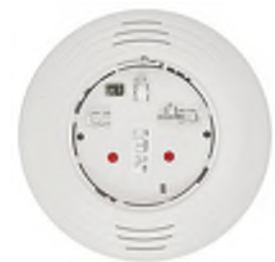
B200S-WH Sounder Base (White)