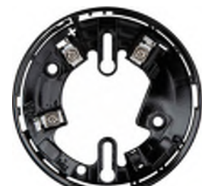
B501-BL Flangeless 4" Base (Black)