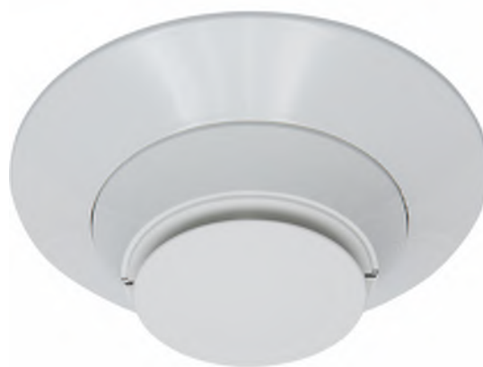
FSP-951 in B300-6 Base