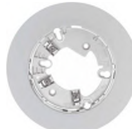
B300-6 Standard 6" Base (White)

The B200S sounder and -LF sounder bases (B200S-WH/B200S-IV/B200S-LF-WH/B200S-LF-IV) adopt the same address as the detector, but use a unique device type on the loop. The Fire Alarm Control Panel (FACP) can use that address to command an individual sounder — or a group of sounders — to activate. The command set from the FACP can be tailored to multiple event-driven tone outputs allowing selection of volume (75 or 85 dBA), tone (ANSI Temporal 3, ANSI Temporal 4, or March Time) and group. In addition, some FACP's will enable custom tone patterns. The B200S series sounder bases recognize the System Sensor synchronization protocol. This enables them to be used as a component of the general evacuation signal — along with other System Sensor AV appliances — when connected to a power supply or FACP output capable of generating the System Sensor synchronization pulses.