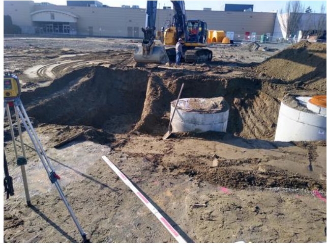
storm vault west side 6