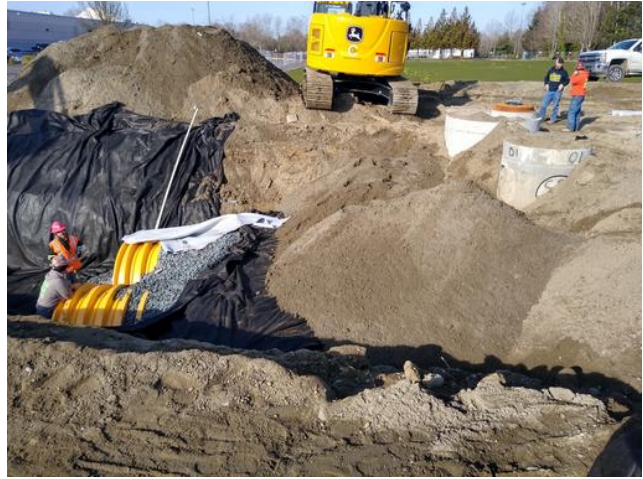
storm vault west side 2