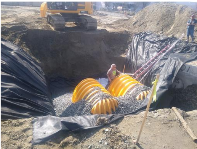
storm vault west side 5