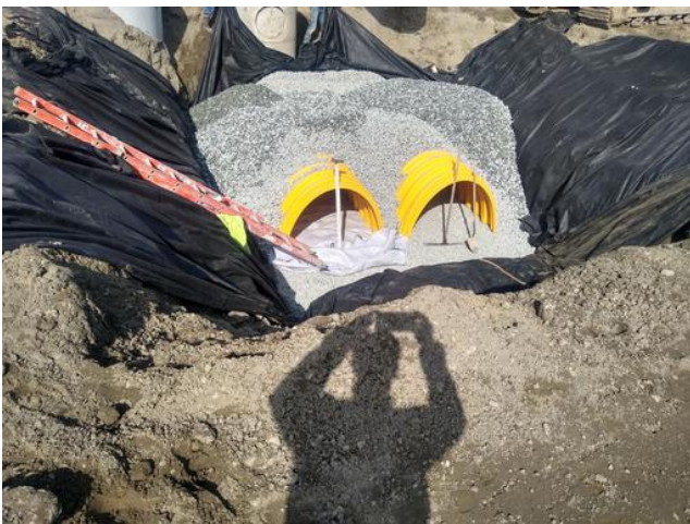
storm vault west side 3