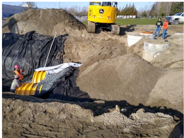
storm vault west side 2