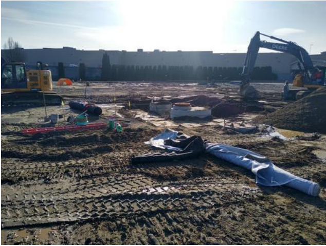
storm vault west side 7