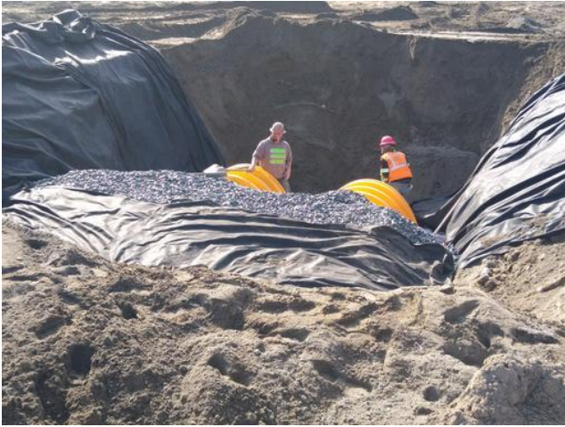
storm vault west side 1