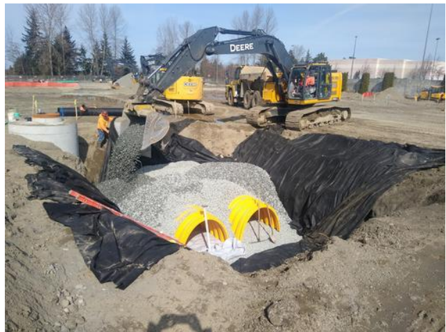
storm vault west side 4