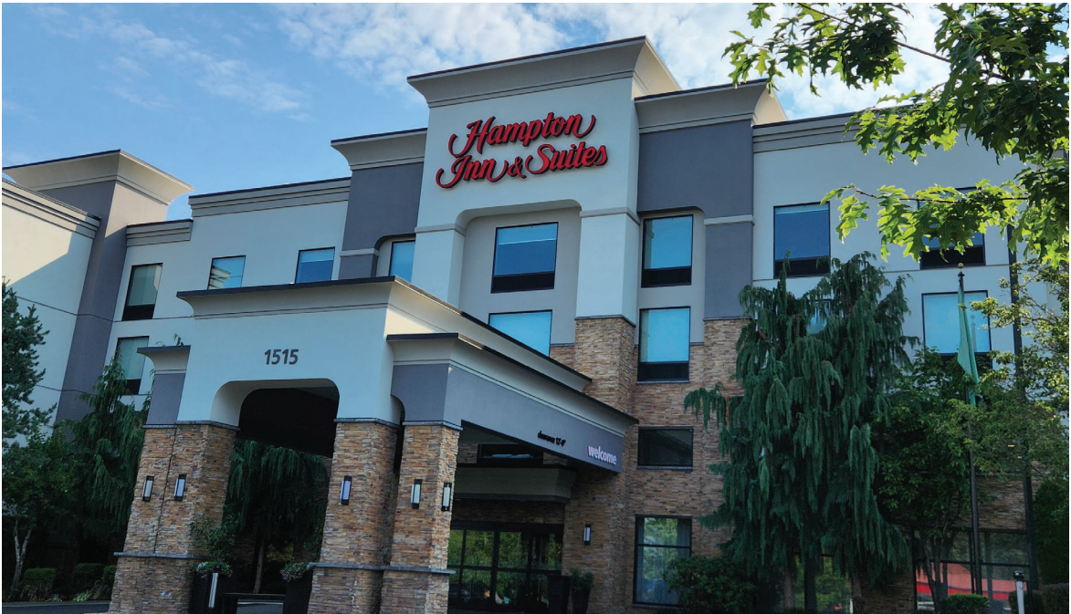
Location C Illuminated Wall Sign Approx. 60 SqFt.