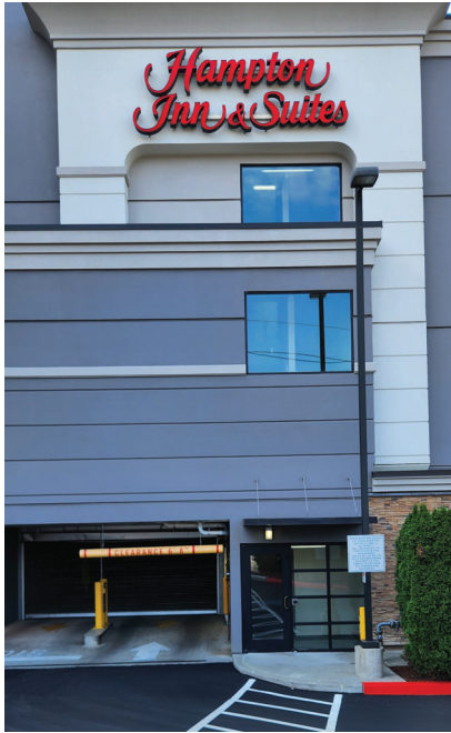
Location A Illuminated Wall Sign Approx. 60 SqFt.