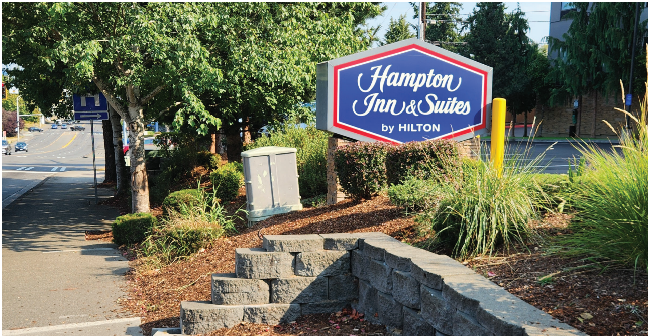
Location D Monument Sign Approx. 30 SqFt.