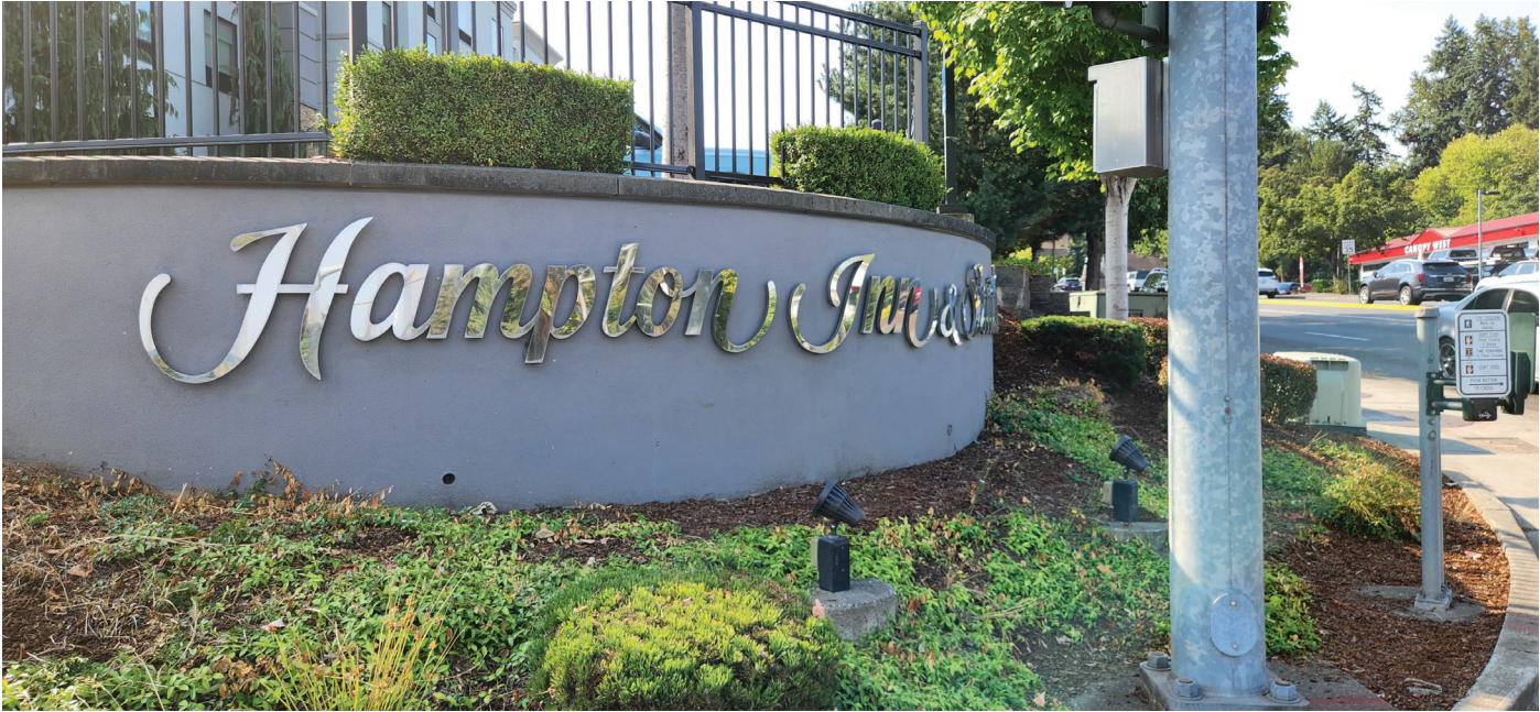
Location B Non-Illuminated Wall Sign Approx. 30 SqFt.