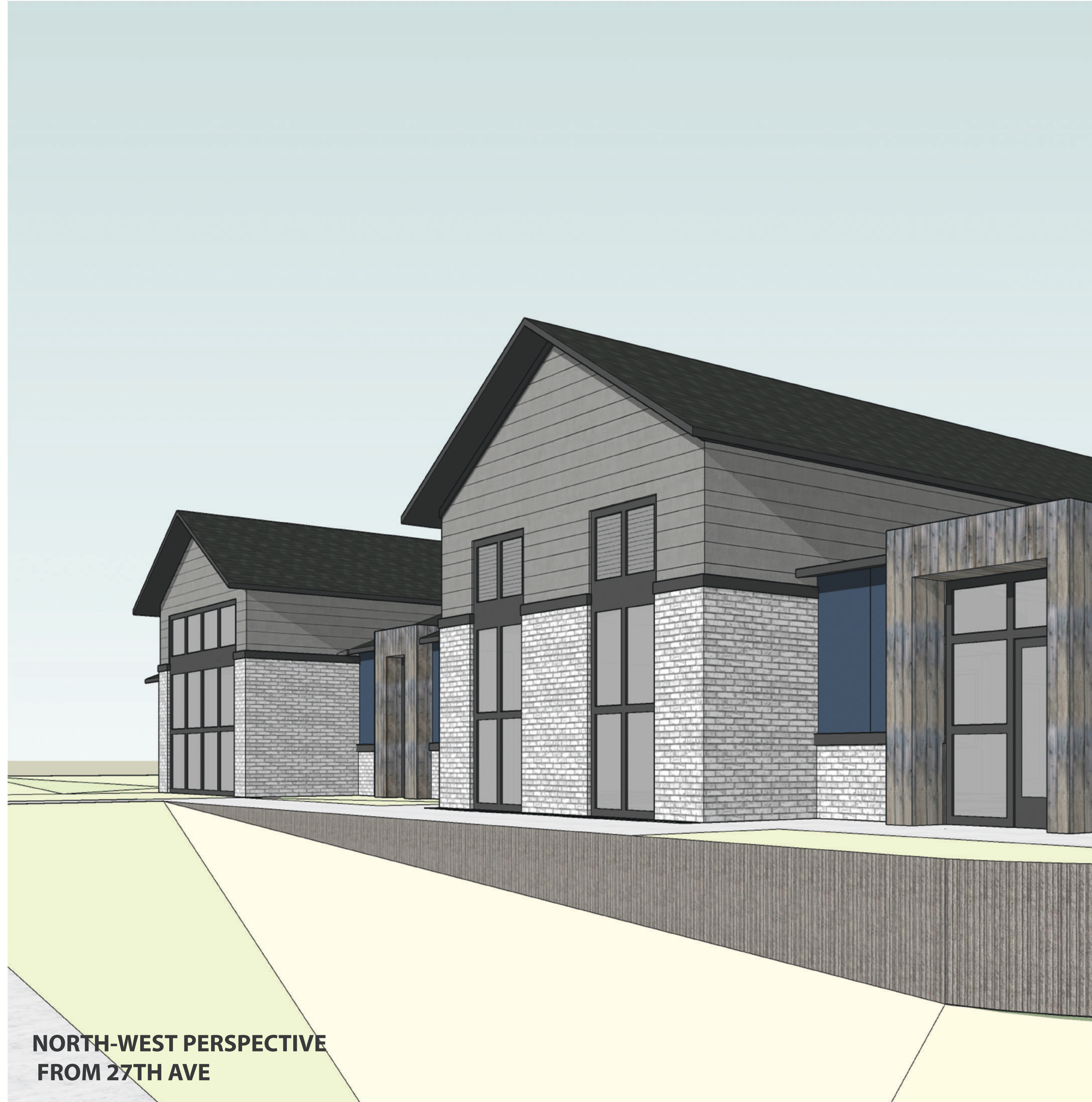
NORTH-WEST PERSPECTIVE FROM 27TH AVE