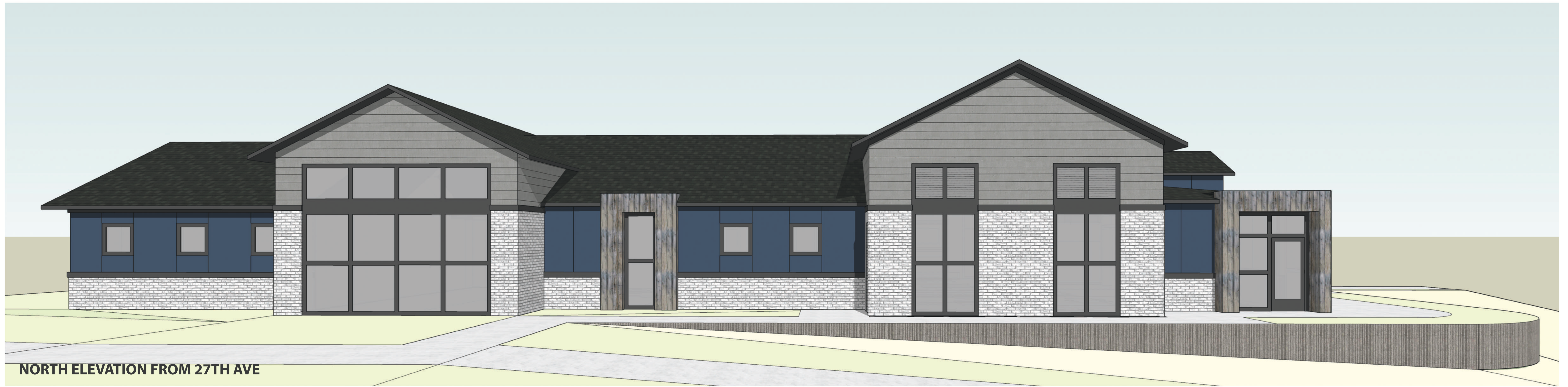
NORTH ELEVATION FROM 27TH AVE