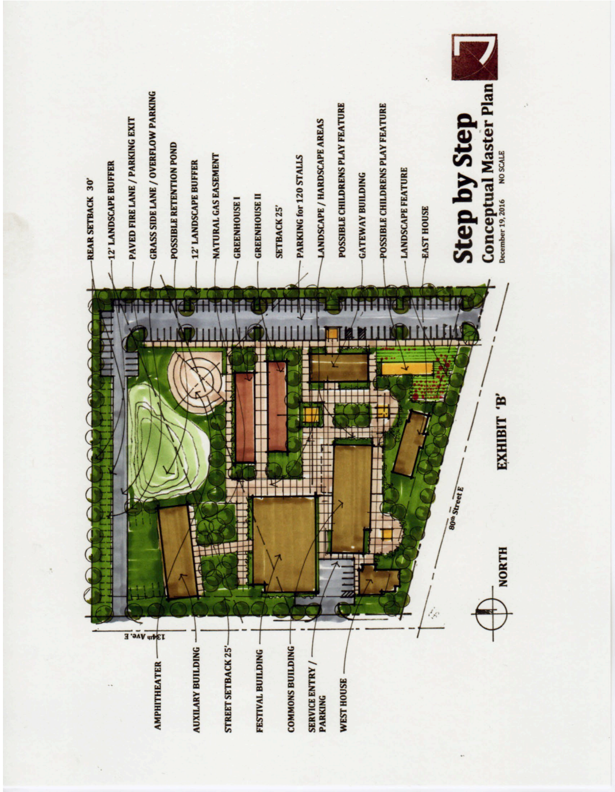
Exhibit B Map showing Proposed Redevelopment.