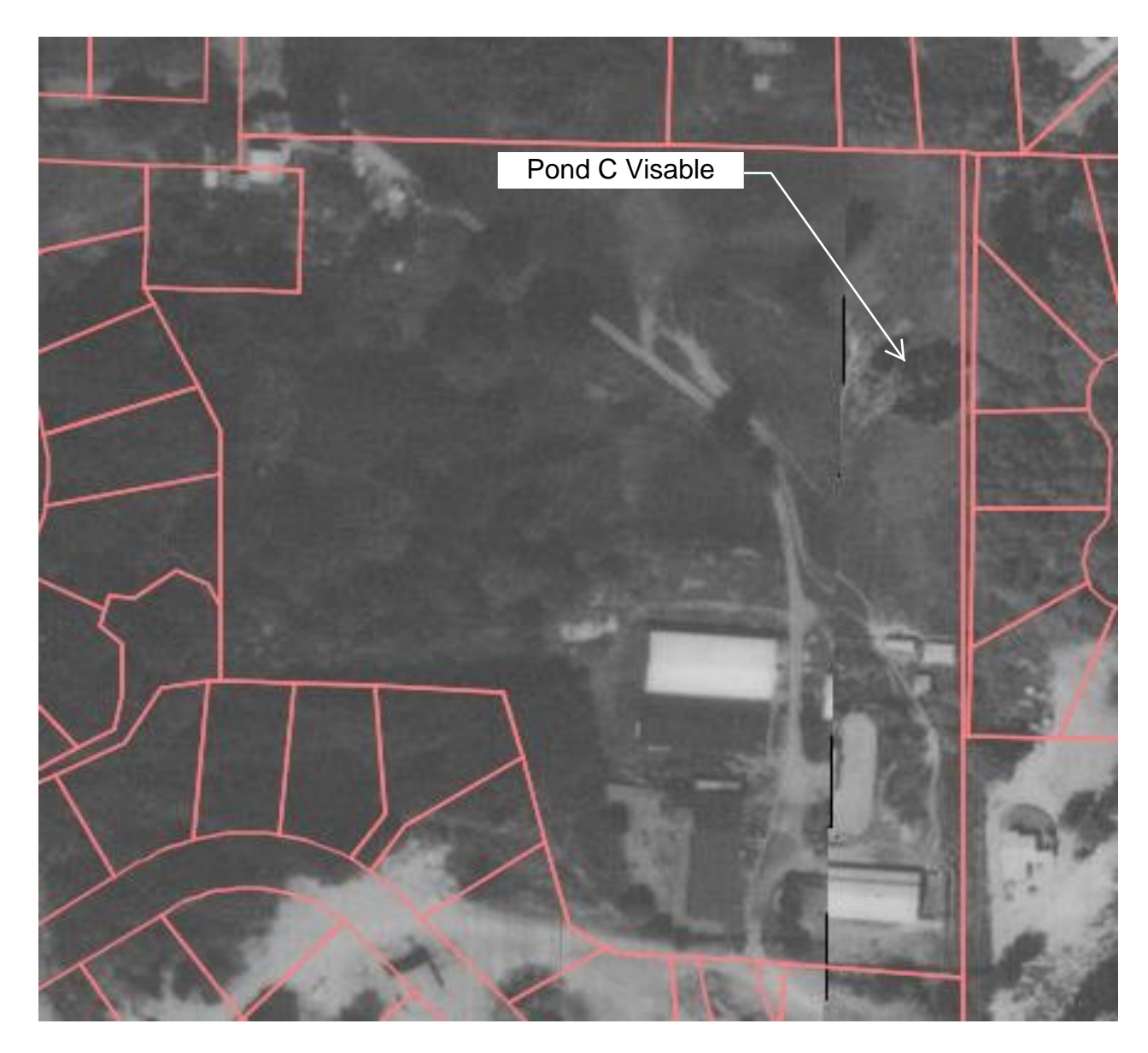
Photo 2: 1985 Aerial photo with eastern most pond no excavated ponds present.