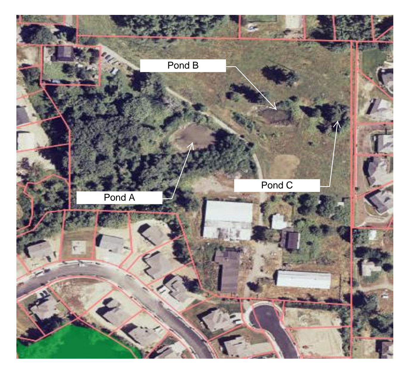
Photo 4: 1998 Aerial photo (color) with three (3) excavated ponds present.