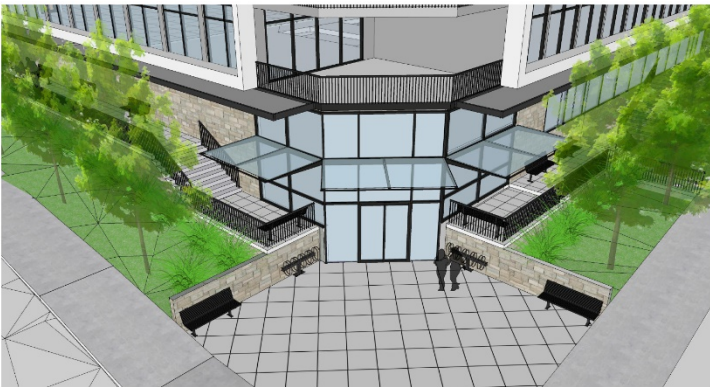
AERIAL VIEW OF ENTRY AT NORTHWEST CORNER