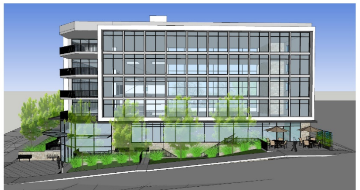
VIEW FROM S MERIDIAN (WEST)