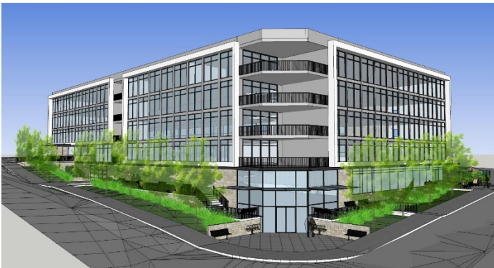
VIEW AT CORNER OF S MERIDIAN AND 17TH AVE. SE