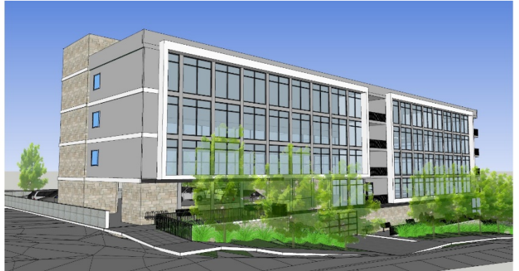
STREET VIEW ALONG 17TH AVE. SE (NORTHEAST)