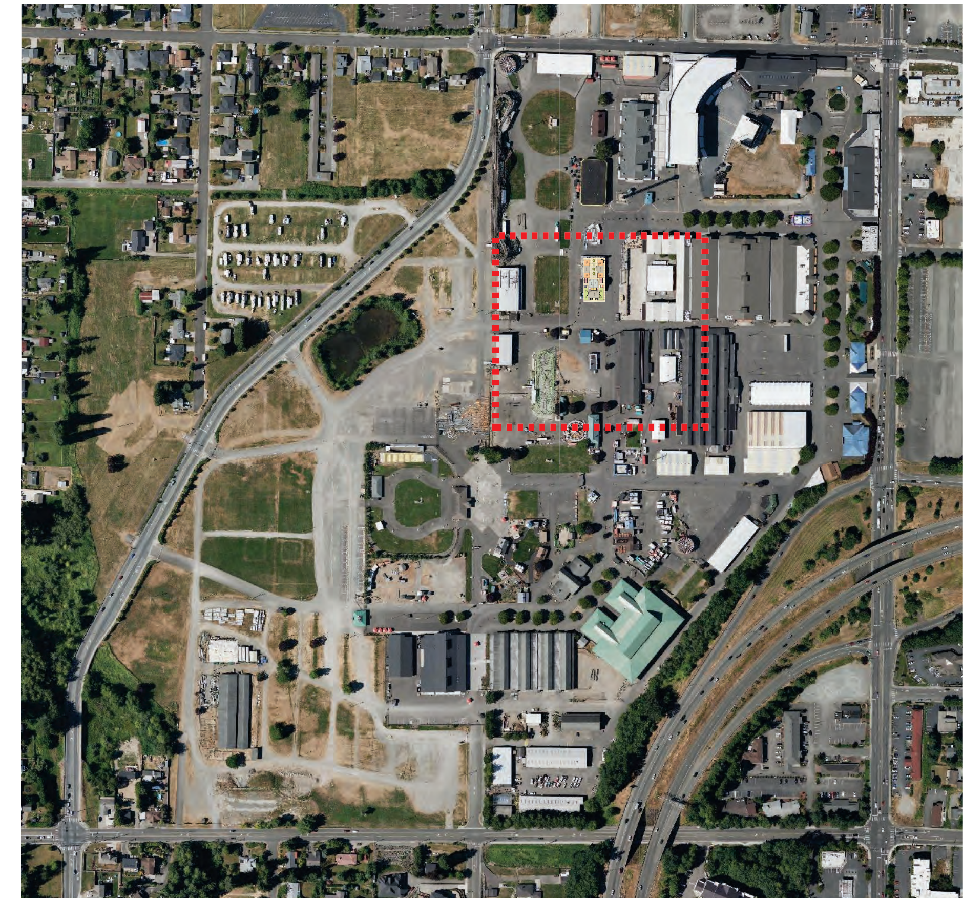
Vicinity Map SITE NARRATIVE

The site for the New International Village is the same as at the original facility. A survey was conducted which located most of the utility infrastructure. Soils testing was also conducted. As the project proceeds, the Fair is focused on the appropriate connection to utilities. There is also a focus on fire hydrants, fire flow and emergency vehicle access. We have appreciated earlier Gold Gate discussion with the City pertaining to these critical issues. It is important to the Fair to incrementally be aware of the larger site issues as incremental projects proceed. An ongoing discussion of life safety strategy is welcomed.