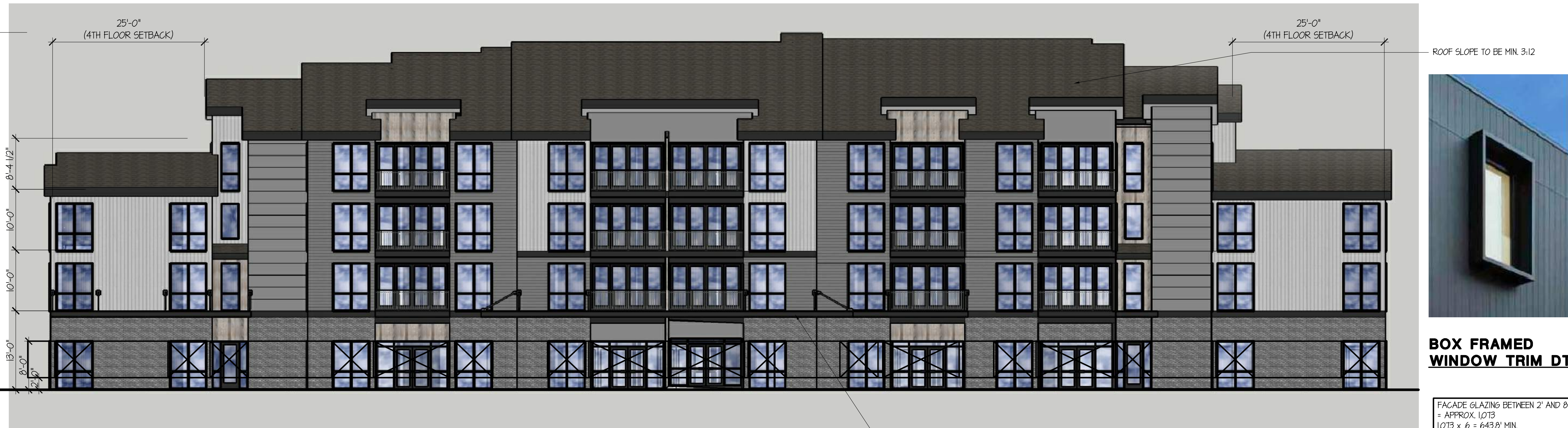
WEST ELEVATION SCALE: 3/32"=1'-0"

6'-0" PRE-FINISHED STEEL ANNING WITH METAL DECKING TO INTERNAL GUTTER AND TO DOWNPOUT. CONNECT TO TIGHTLINE.