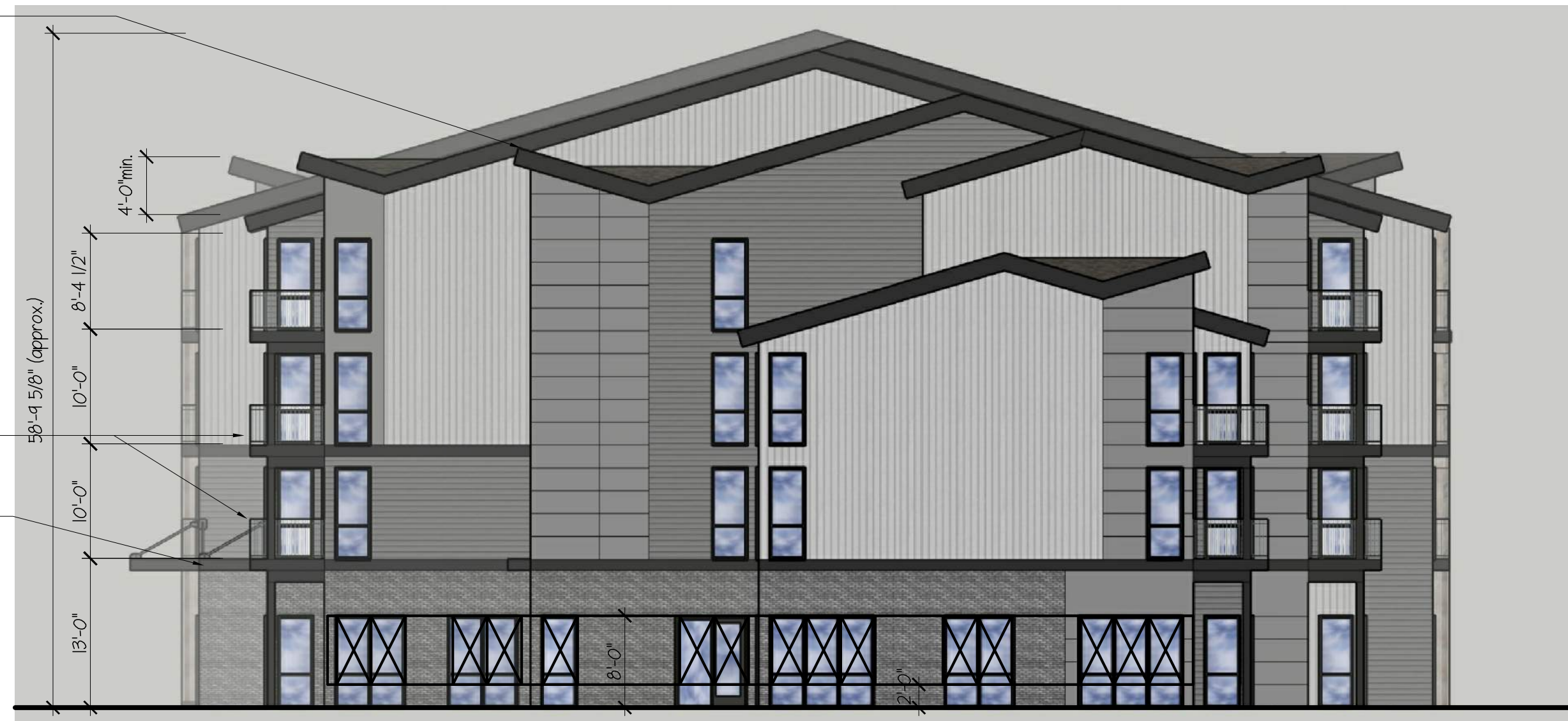
SOUTH ELEVATION SCALE: 3/32"=1'-0"

10x8' MINI DECKS TYPICAL 6'-0" PRE-FINISHED STEEL ANNING WITH METAL DECKING TO INTERNAL GUTTER AND TO DOWNPOUT. CONNECT TO TIGHTLINE.