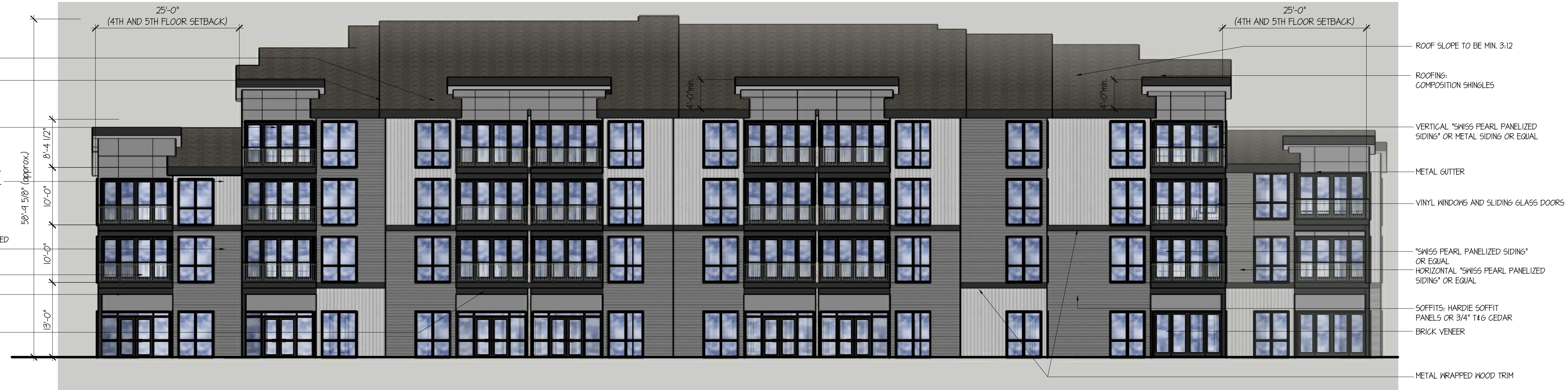
EAST ELEVATION SCALE: 3/32"=1'-0"

FACADE GLAZING BETWEEN 2' AND 8' = APPROX. 452 452 x 6.0' = 2712' MIN. ACTUAL = 272; THEREFORE "OK"