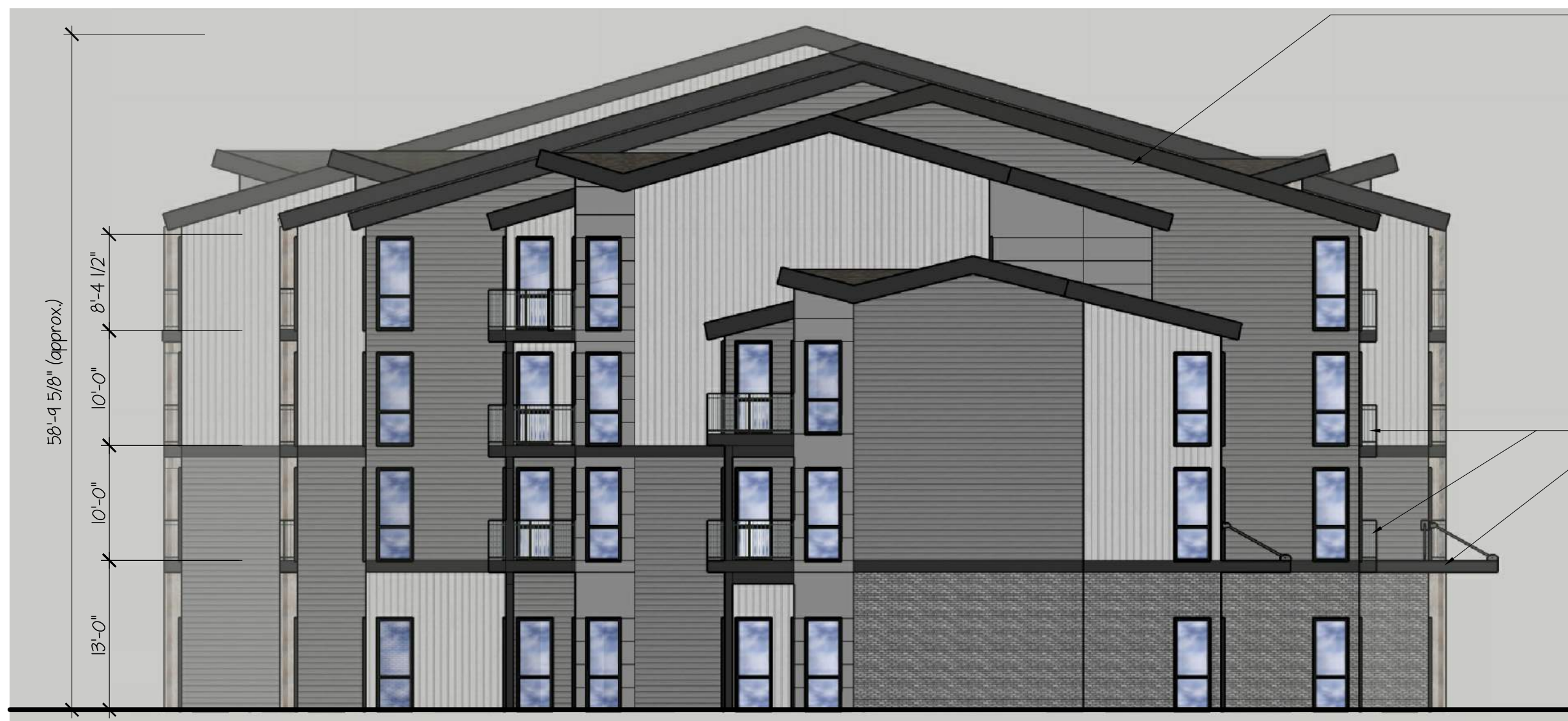
NORTH ELEVATION SCALE: 3/32"=1'-0"

FACADE GLAZING BETWEEN 2' AND 8' = APPROX. 1073 1073 x 6' = 6438' MIN. ACTUAL = 754 sq. ft.; THEREFORE "OK"