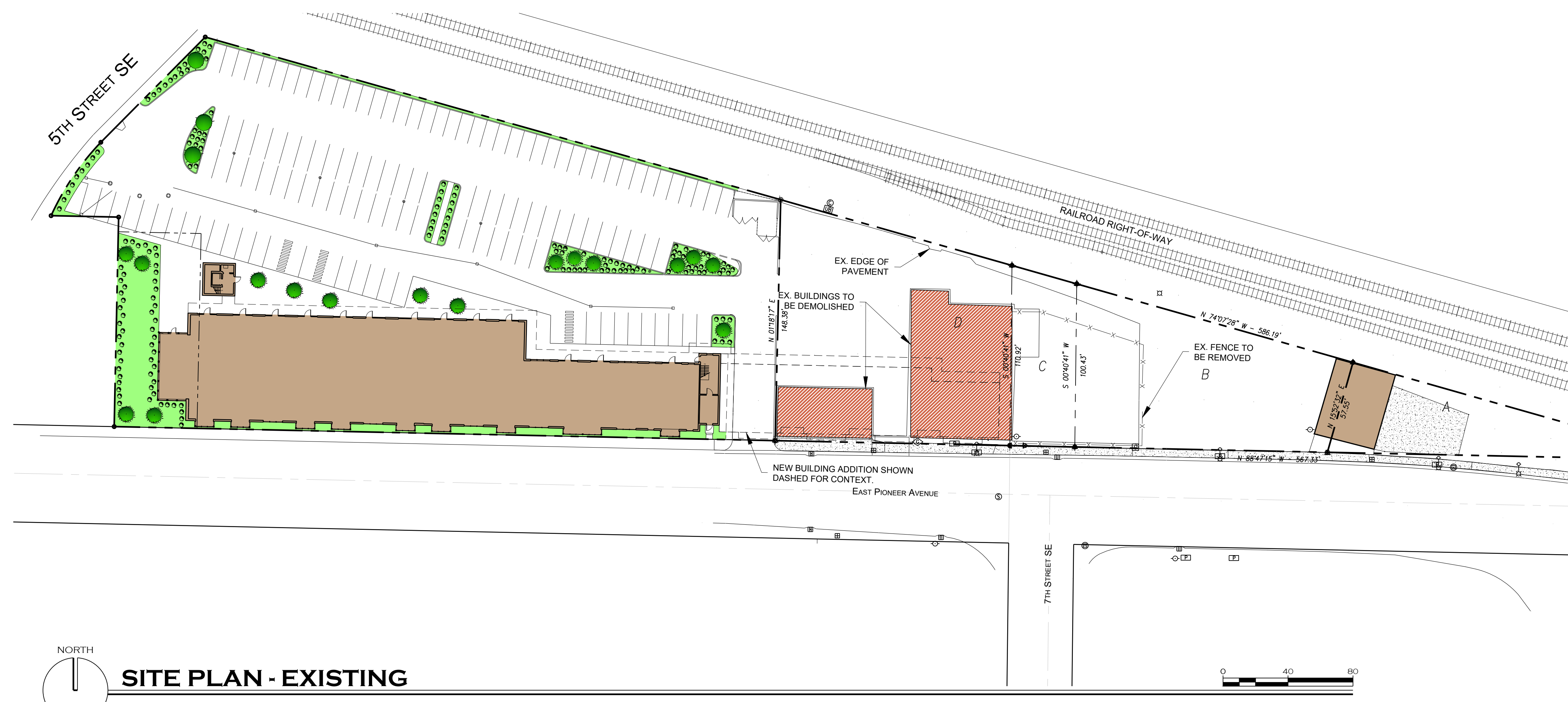
SITE PLAN - EXISTING