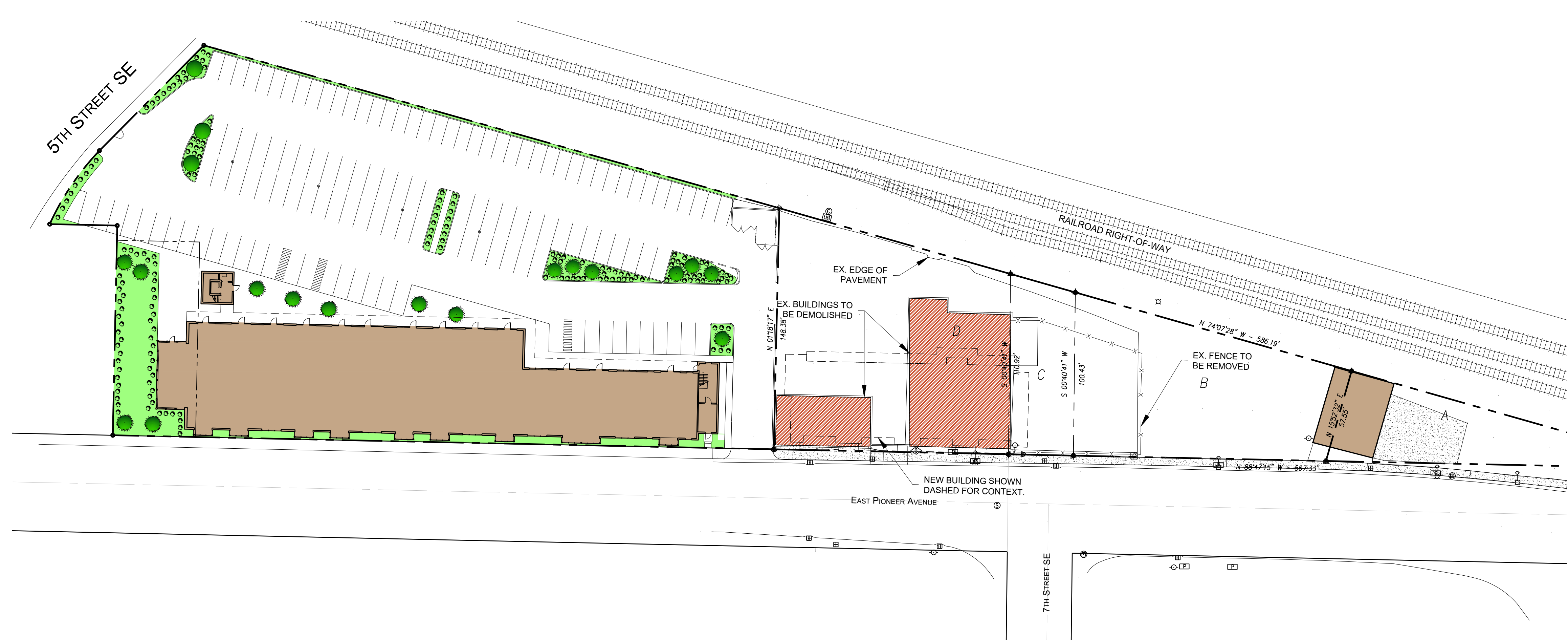
NORTH SITE PLAN - EXISTING 0 40 80