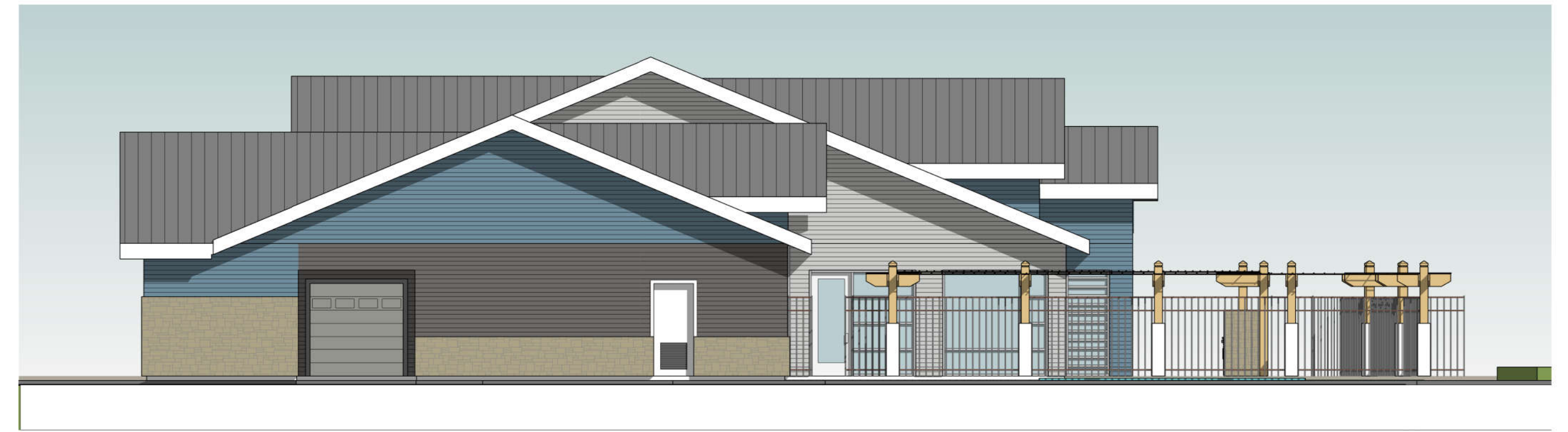
West Elevation - Side 1/8" = 1'-0"