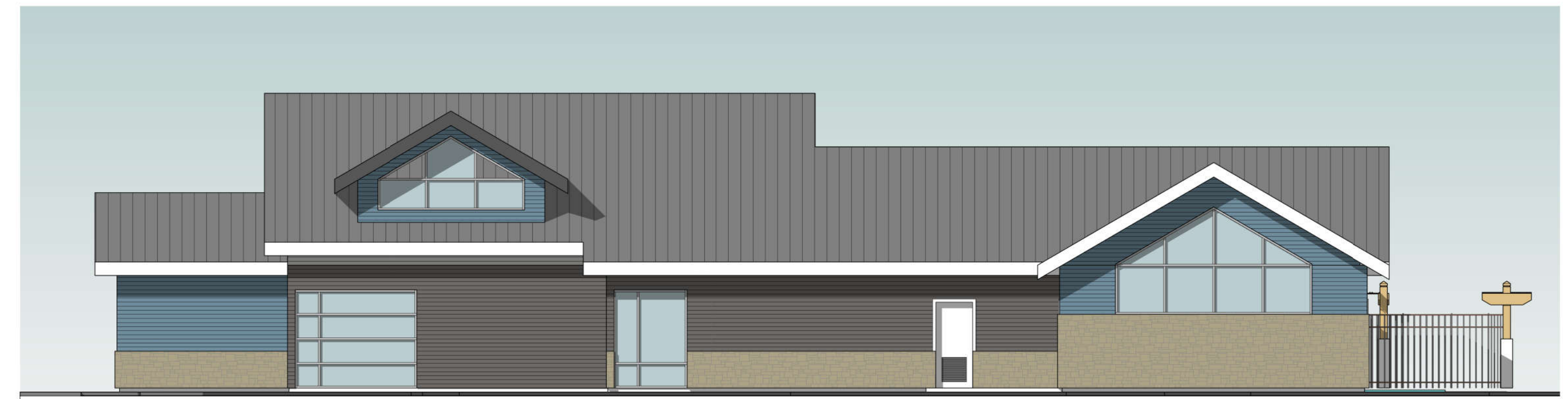
North Elevation - Street 1/8" = 1'-0"