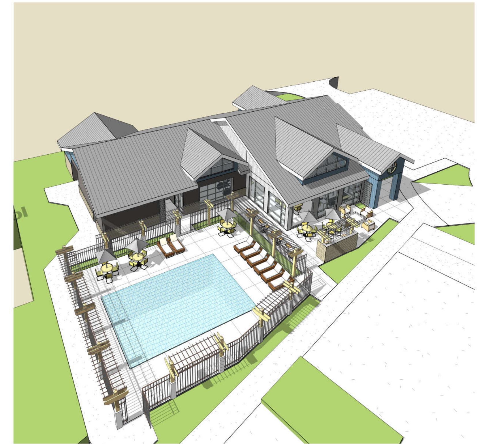
Perspective - Aerial SW