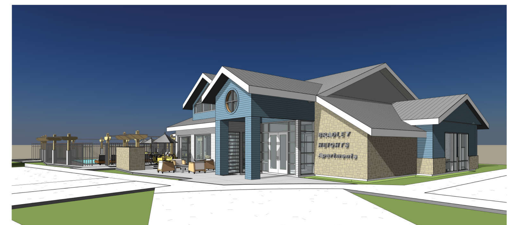
Perspective - Entry SE