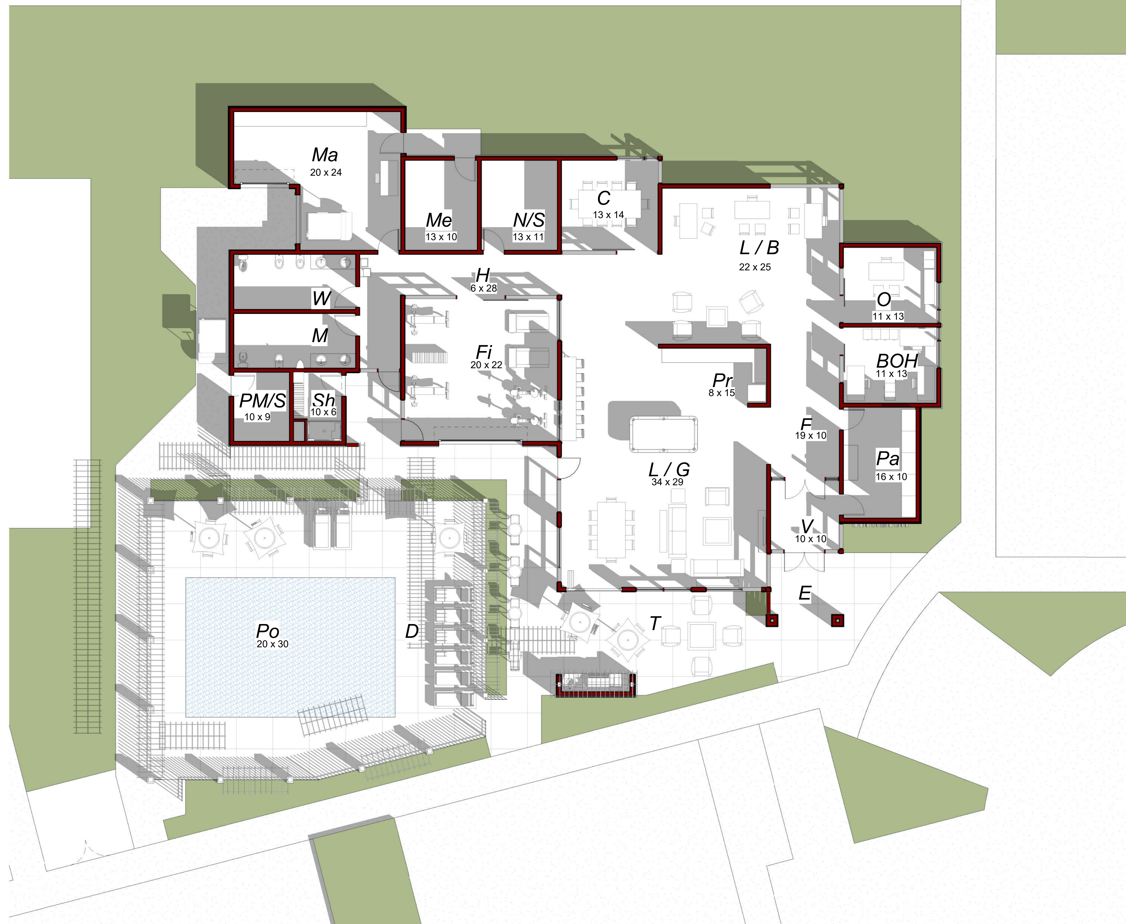
Recreation Furniture Plan 1/8" = 1'-0"