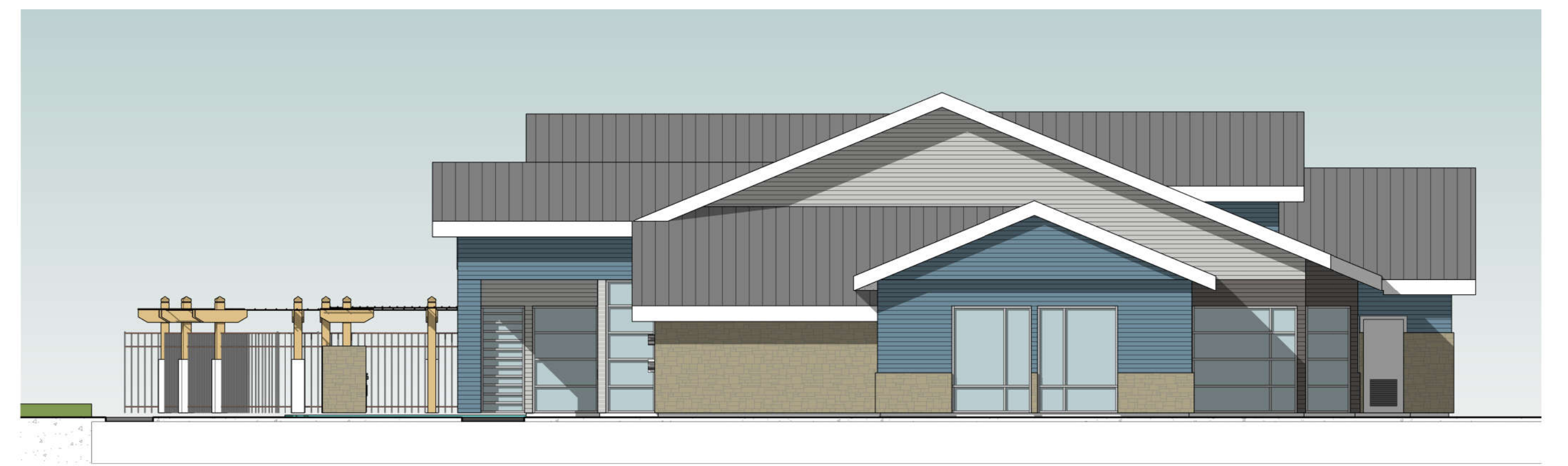
East Elevation - Side 1/8" = 1'-0"