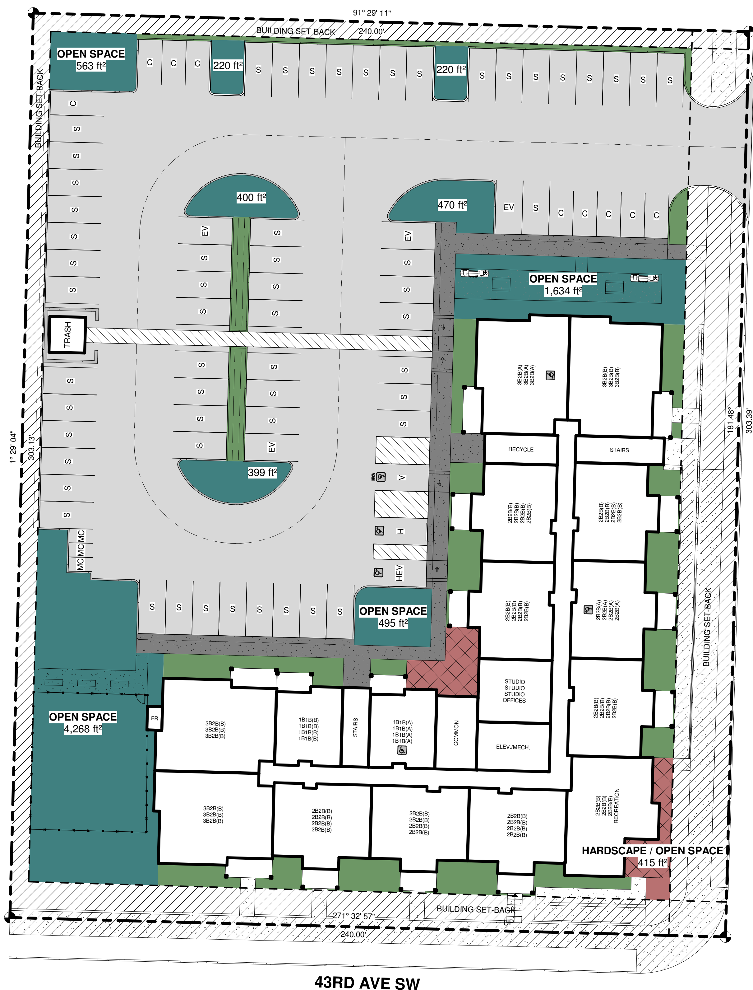
CONCEPTUAL SITE PLAN