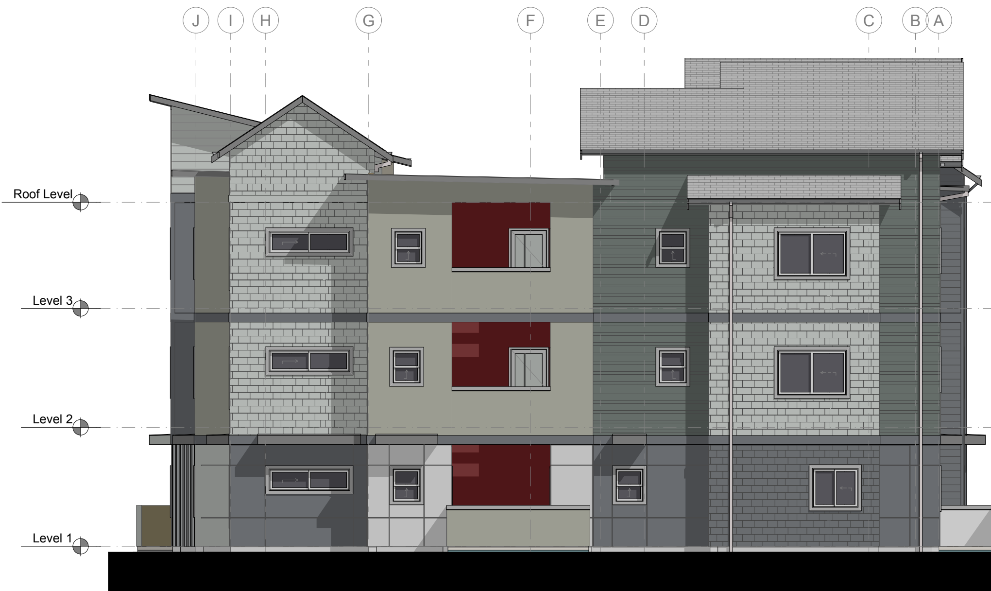
2 RIGHT ELEVATION -BUILDING TYPE No. 1 SCALE: 1/8" = 1'-0"