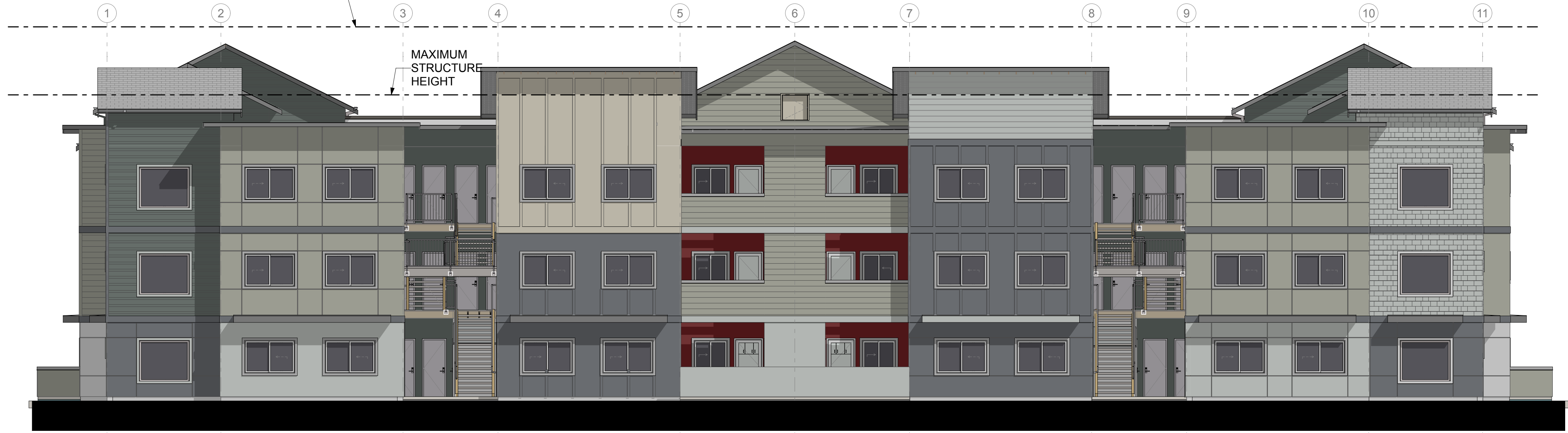
1 FRONT ELEVATION BUILDING TYPE No. 1 SCALE: 1/8" = 1'-0"

The ridge of a gable, hip, gambrel or similar pitched roof shall not extend over eight feet above the specified maximum height limit.