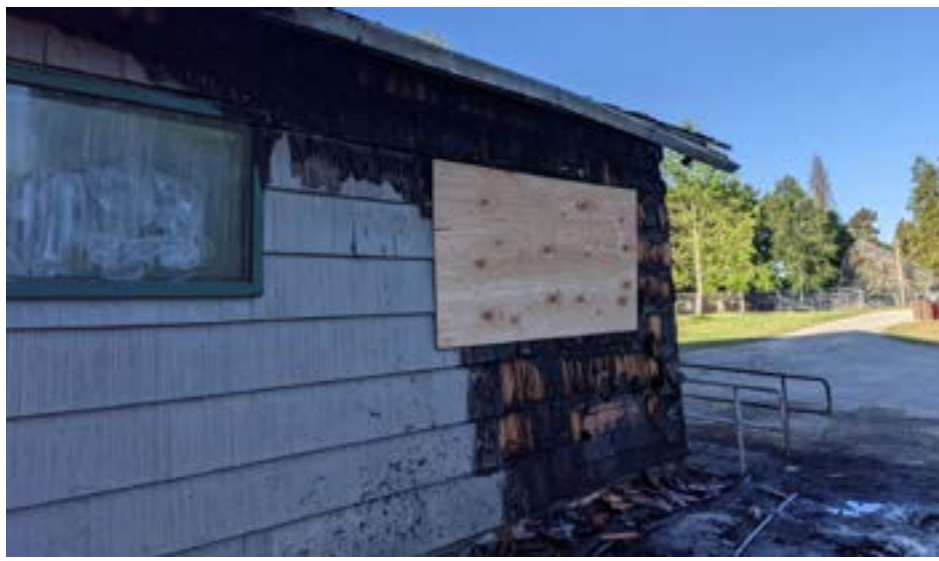
In 2021, the fieldhouse at hit by an arsonist and partially destroyed.

The sprayground opened May 3 as part of its normal weekends-only