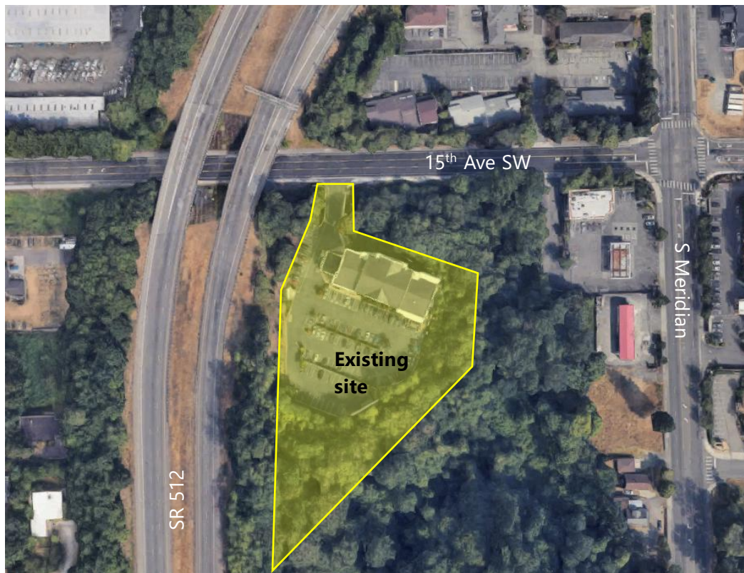
Exhibit 1 – Fairfield Inn & Suites Vicinity Map

The Puyallup Fairfield Inn & Suites hotel is located at 202 15 th Avenue SW as shown in Exhibit 1 below.