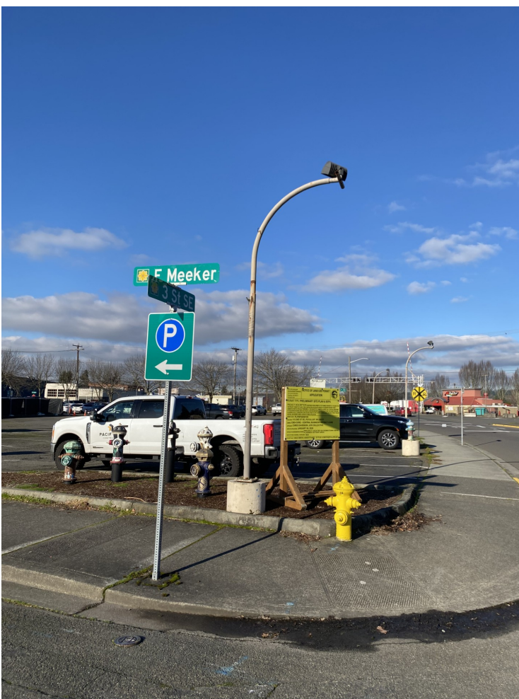
SE Corner of site (3rd and Meeker)