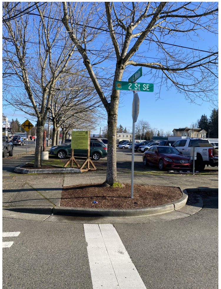
NW Corner of site (2nd and Main)