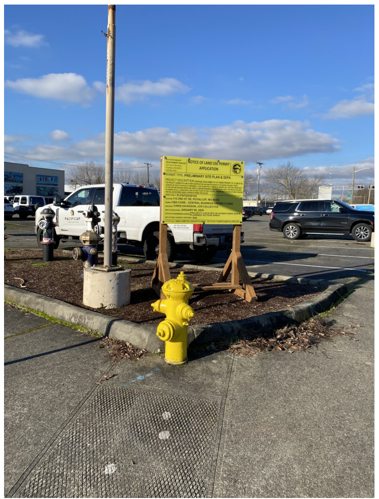
SE Corner of site (3rd and Meeker)